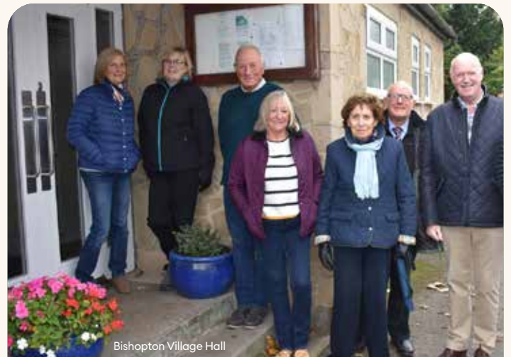
Bishopton Village Hall