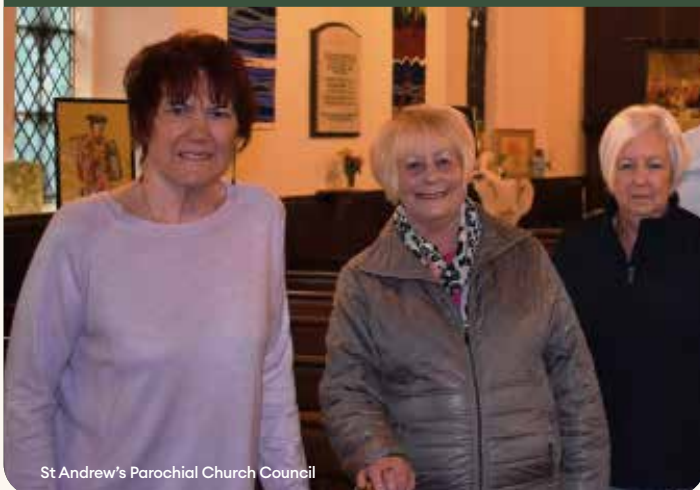
St Andrew's Parochial Church Council