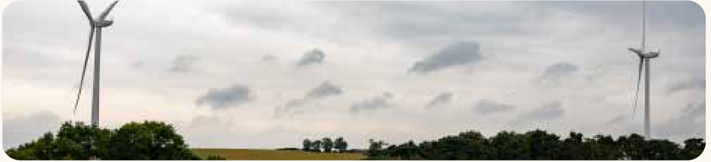
Moor House Wind Farm near Darlington