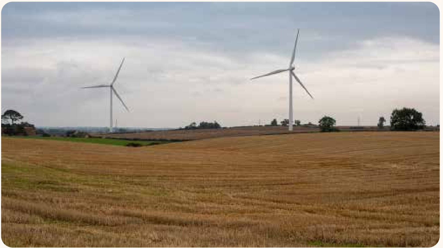
Moor House Wind Farm near Darlington