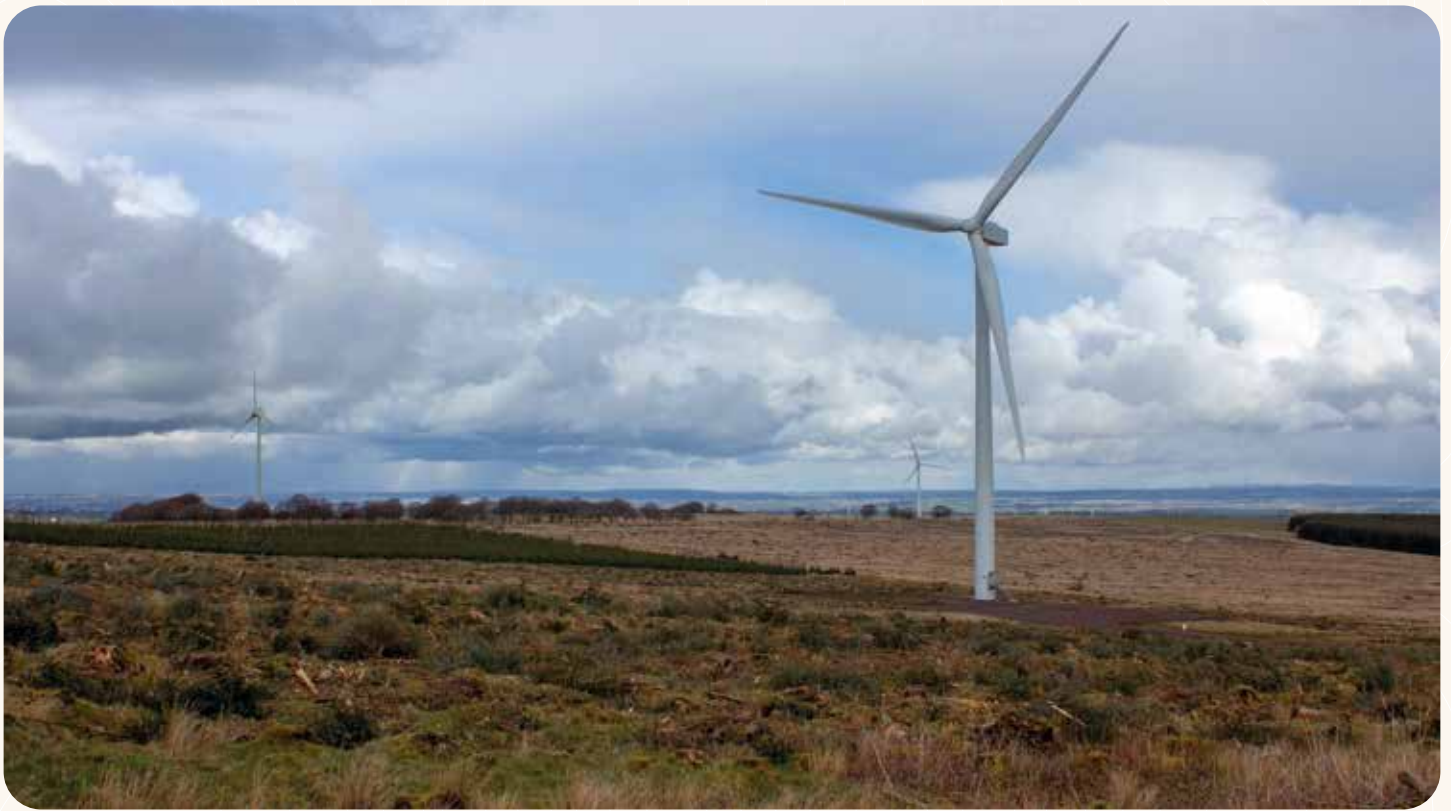
Kype Muir Wind Farm, South Lanarkshire