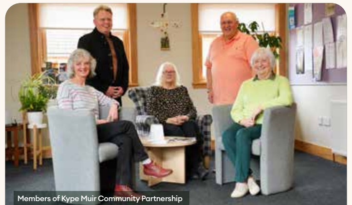
Members of Kype Muir Community Partnership