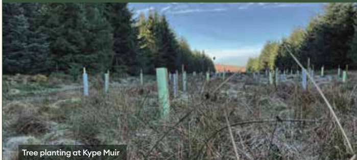
Tree planting at Kype Muir