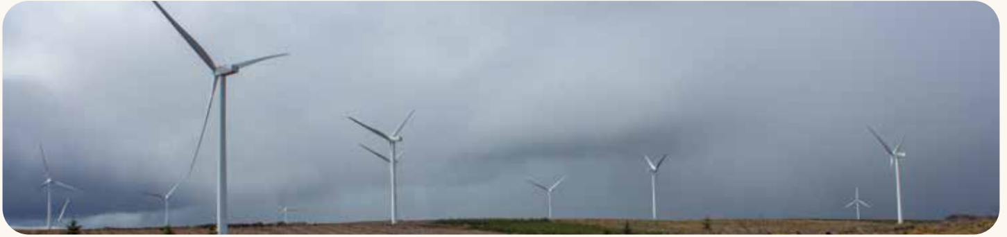
Kype Muir Wind Farm, South Lanarkshire