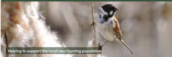
Helping to support the local reed bunting population